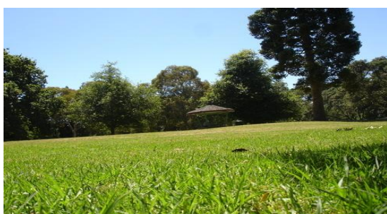
View of Cornwall Park

All TCM qualifications offered by the College are CMCNZ-accredited in 2025 for a period of 5 years.