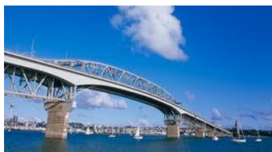
Auckland Harbour Bridge